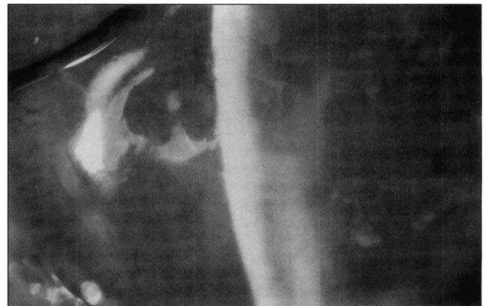
Fig. 2 - Biomicroscopy 4 weeks after the procedure. The epithelium is completely healed.