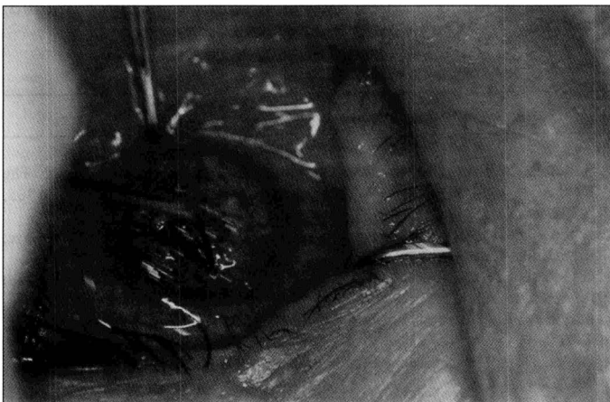
Fig. 1 - Termocautery applications. Note the whitening of Bowman's layer.

F = Female; M = Male; P = Pseudophakic; A = Aphakic; IOP = Intraocular pressure; PO = Postoperative day; Preop = Preoperative day